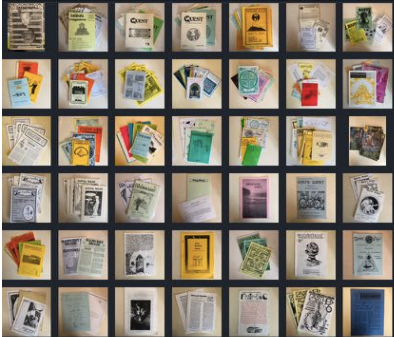
Collection of UK Pagan, Earth Mysteries, and Paranormal fanzines from Robert Trubshaw [Part 1]

[Please Note: there is a significant discount if Part 1 and 2 are acquired together]